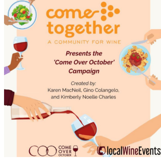
Come Over October

08-22-2024 01:18 PM CET | Food & Beverage Press release from: LocalWineEvents.com